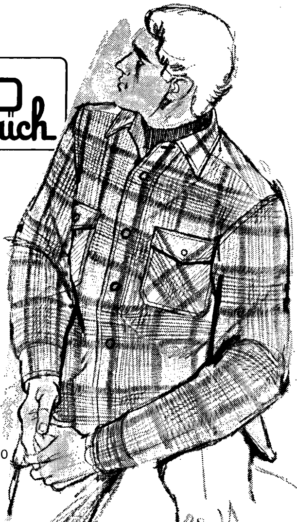
Gilbert's (Downtown and on the Campus)—South Bend