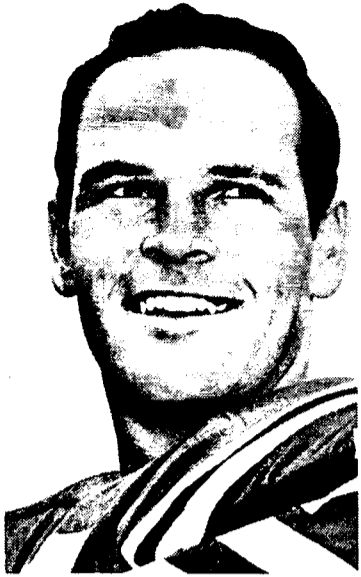
Ex-Irish Pro: No. 3