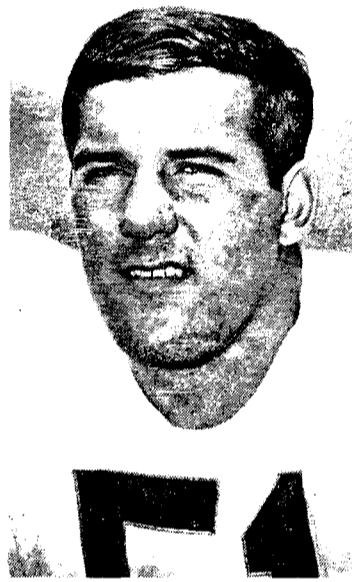
Ex-Irish Pro: No. 4