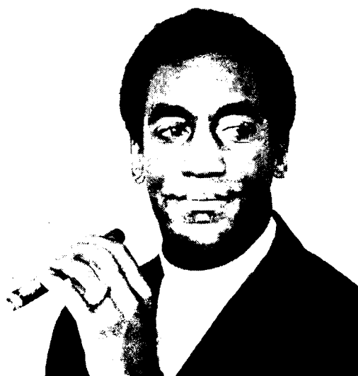
Bill Cosby will be here tomorrow night.