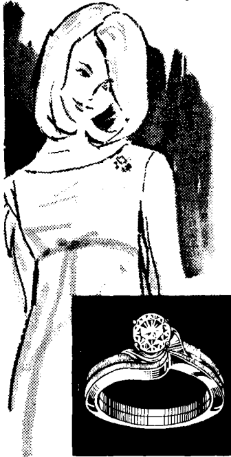
Illustration Enlarged Her fondest dreams come true when you choose a Contoura diamond bridal set.

CONTOURA™ with Diamonds of Ultimate beauty ..