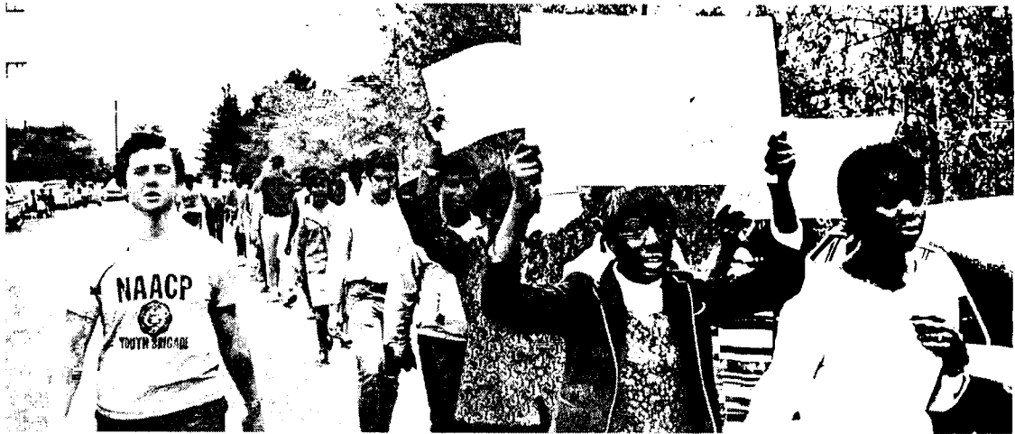
NAACP Easter trip causes stir in Hampton (see page 2)

"If Father Hesburgh doesn't make Pope, I want him to be the new director of the FBI," Capp said.