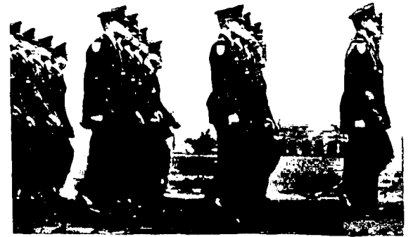
"Marching is the basic leadership program for every officer."