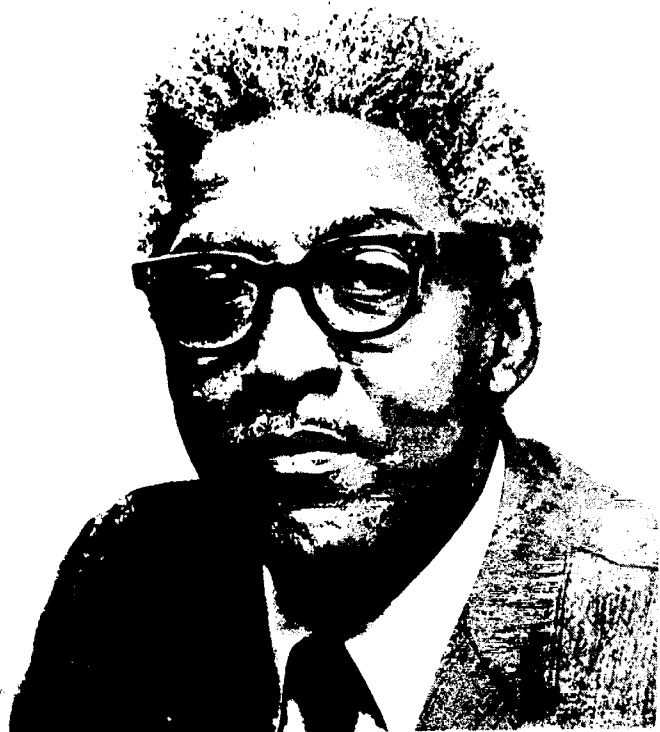
Bayard Rustin, the first Negro Trustee at N.D.