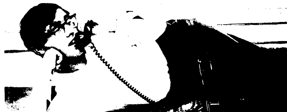
Harold assumes a familiar pose.