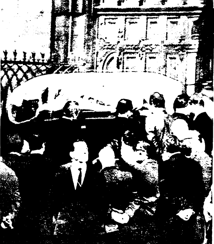
Casket bearing the body of the late Quebec labor Minister Pierre Laporte is carried into Notre Dame Church October 20. Laporte was kidnapped and murdered by members of the Front de Liberation du Quebec his body was found in the trunk of a car.

Police still worked over the green and white frame bungalow in the suburb of St. Hubert. where Laporte was held for a week and then strangled and stabbed through the heart. The bungalow is only two miles from Laporte's home, and is within sight of the air force base-used as a staging area for troops airlifted into Montreal-where LaPorte's bloody body was found stuffed in an auto trunk beside a civilian hangar Saturday night.