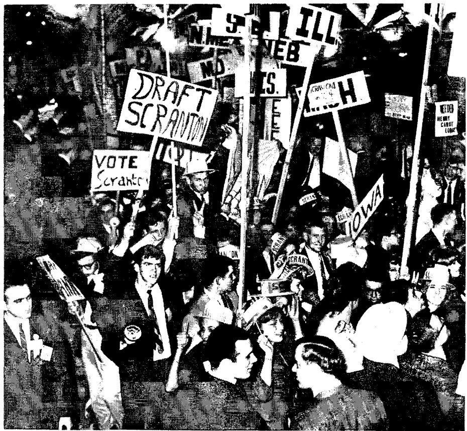
Unlike the 1964 Mock Convention shown here, the 1972 Convention is having trouble getting delegates.

Irish Catholic Breslin, formerly a columnist for the New York Herald Tribune, recently authored "The Gang That Couldn't Shoot Straight," a tragicomedy portraying an attempted assassination of a Mafia Don.