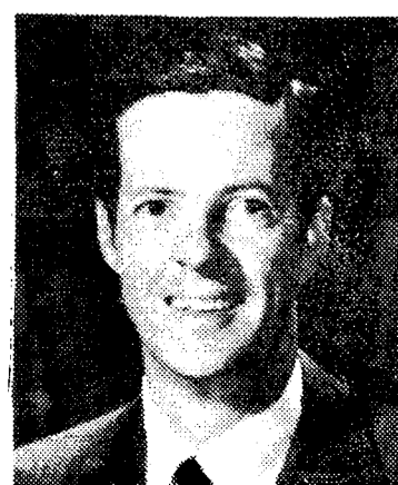
Astronauts to speak at Engineering Symposium Friday (William Anders, James McDivitt, Charles Conrad, Jr., Frank Borman, Joseph Kerwin)