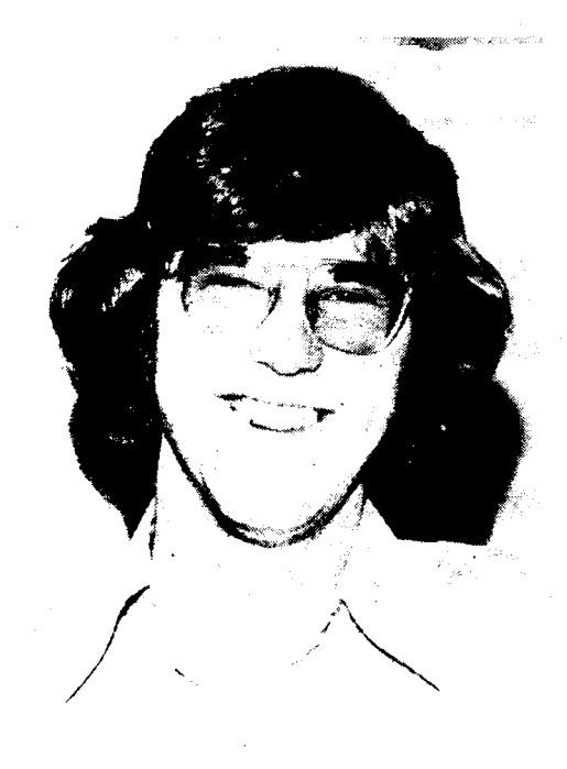
McGinty: The first thing we have to do is develop hall judicial boards in each and every hall.