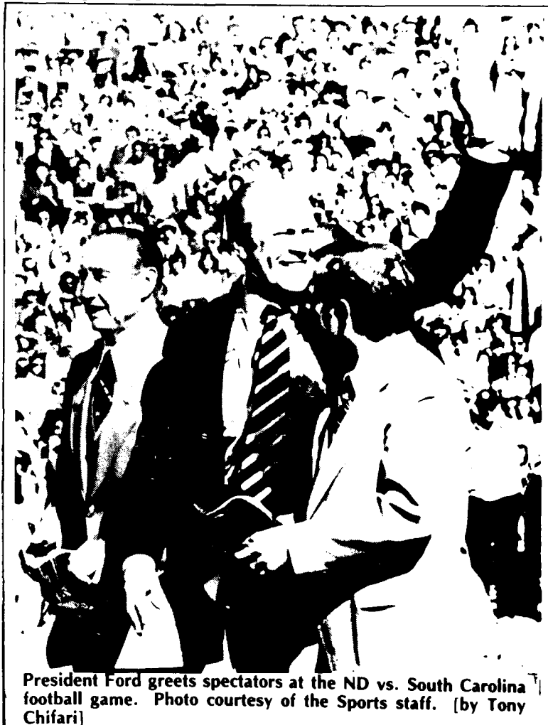
President Ford greets spectators at the ND vs. South Carolina football game.

What better way to commemorate our heritage than to take a breath of air from those days of yesteryear? In New York City, a con artist was selling bottles of air that he claimed had been "corked"