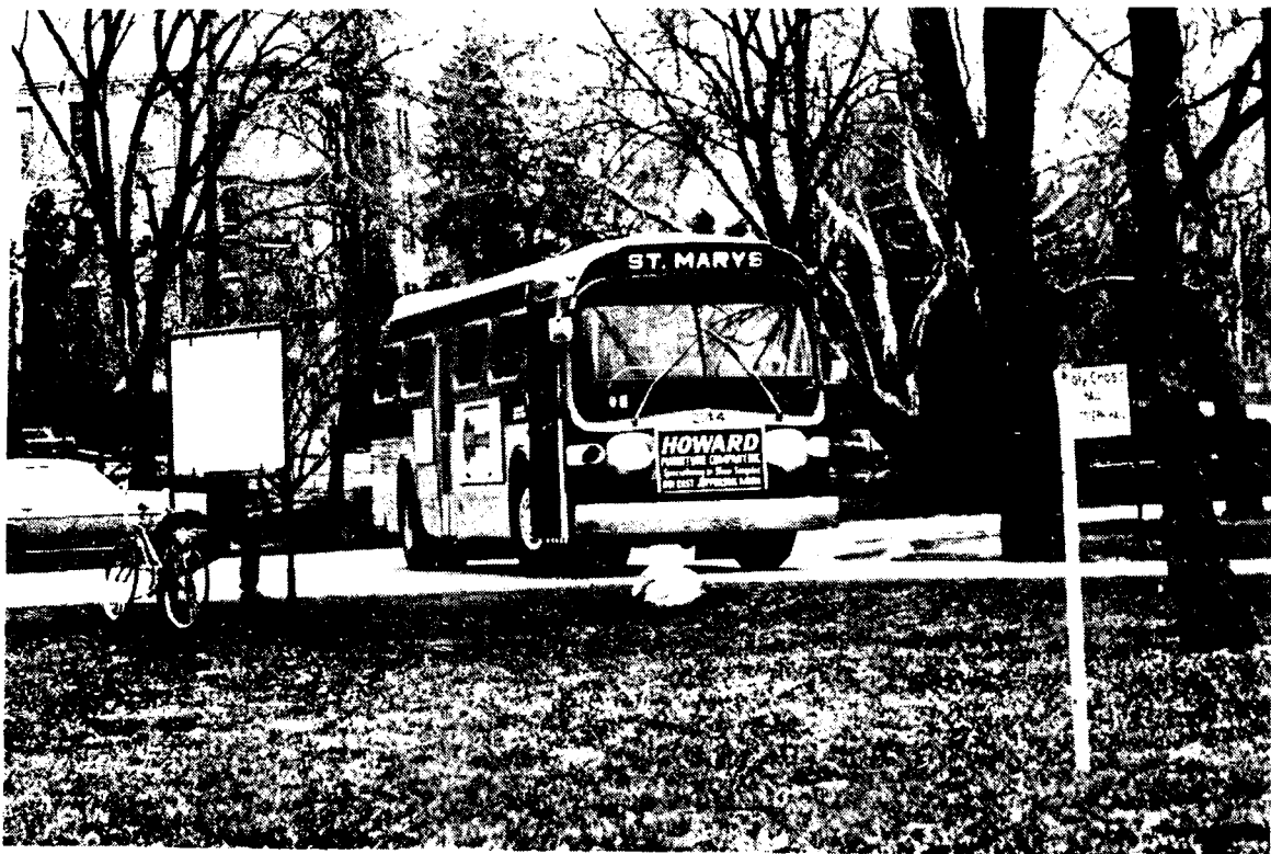
The Shuttlebus service is more efficient than you may think according to a recent survey conducted