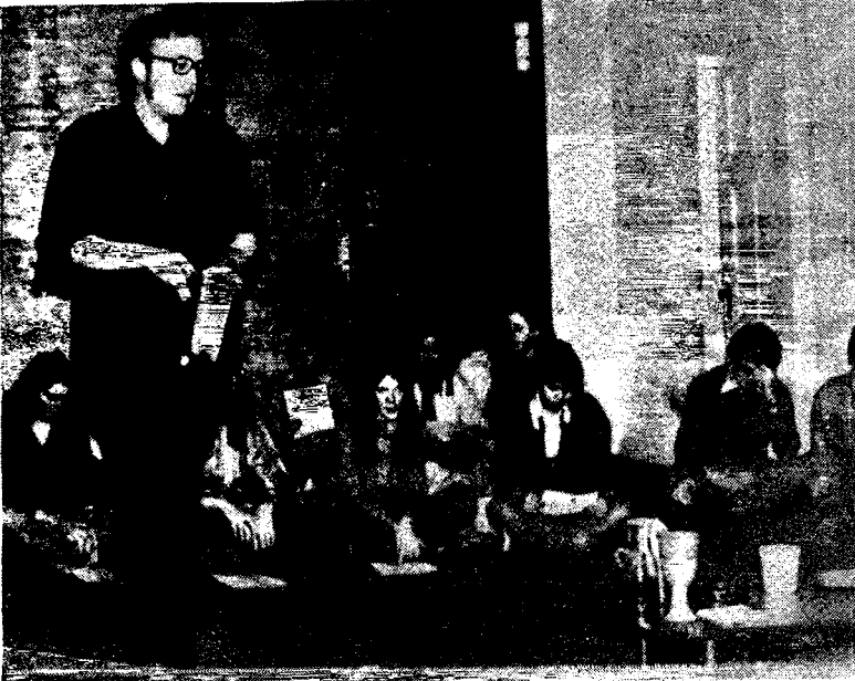
The Wednesday night fasters held a Mass in the Walsh Hall Chapel last night during the dinner hour.