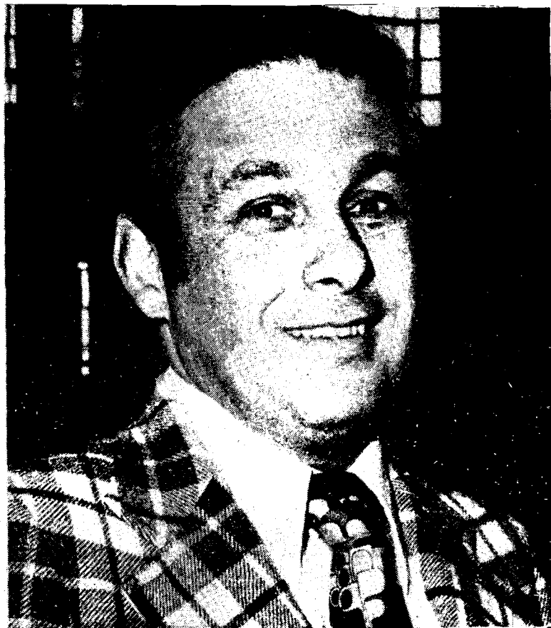
Villanova head basketball coach Roland Massimino is one of the most successful recruiters in the country.