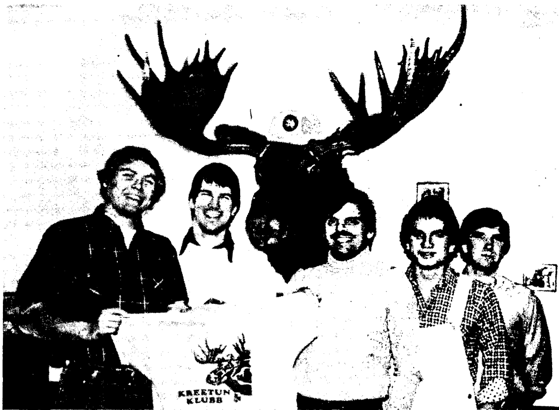
Some people have strange pets!