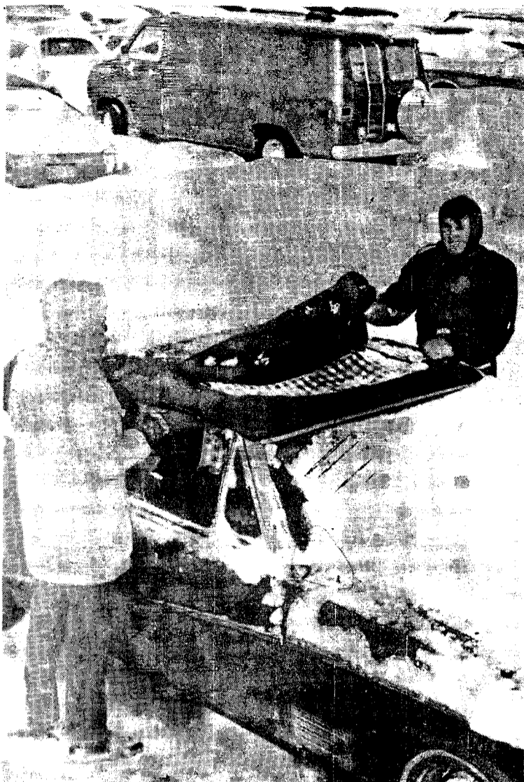
The heavy snows from the blizzard caused several roofs to collapse, including the top on this convertible.

In the second draft, the final phrase is typed, but crossed through with a pen. In the final report it does not appear at all.