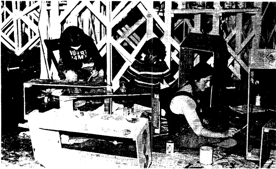
Because last week's blizzard slowed down Mardi Gras construction, students are working hard to complete their booths for the festival.