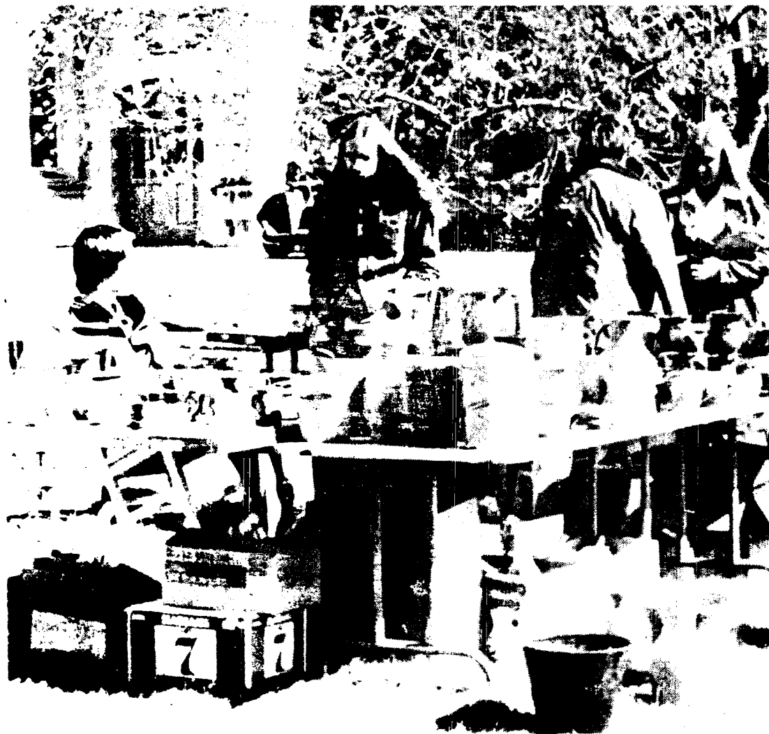
Yesterday's sunshine brought the ND Ceramics Club pottery sale out of O'Shag and on to the quad. The sale continues today and tomorrow.