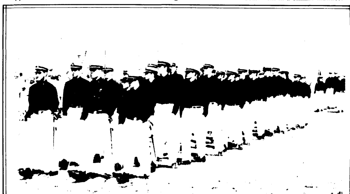
The Naval ROTC held its annual Pass and Review Ceremony and Parade last Saturday. See related story page 3.

Under terms of the proposed sales, Israel would be sold 75 F-16s and 15 F-15s, while Saudi Arabia would receive 60 F-5s. Congress has until May 28 to voice its disapproval of the deal.