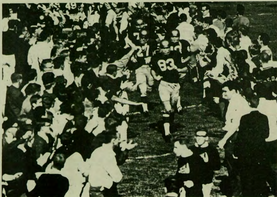
THE SCENE ON SATURDAY