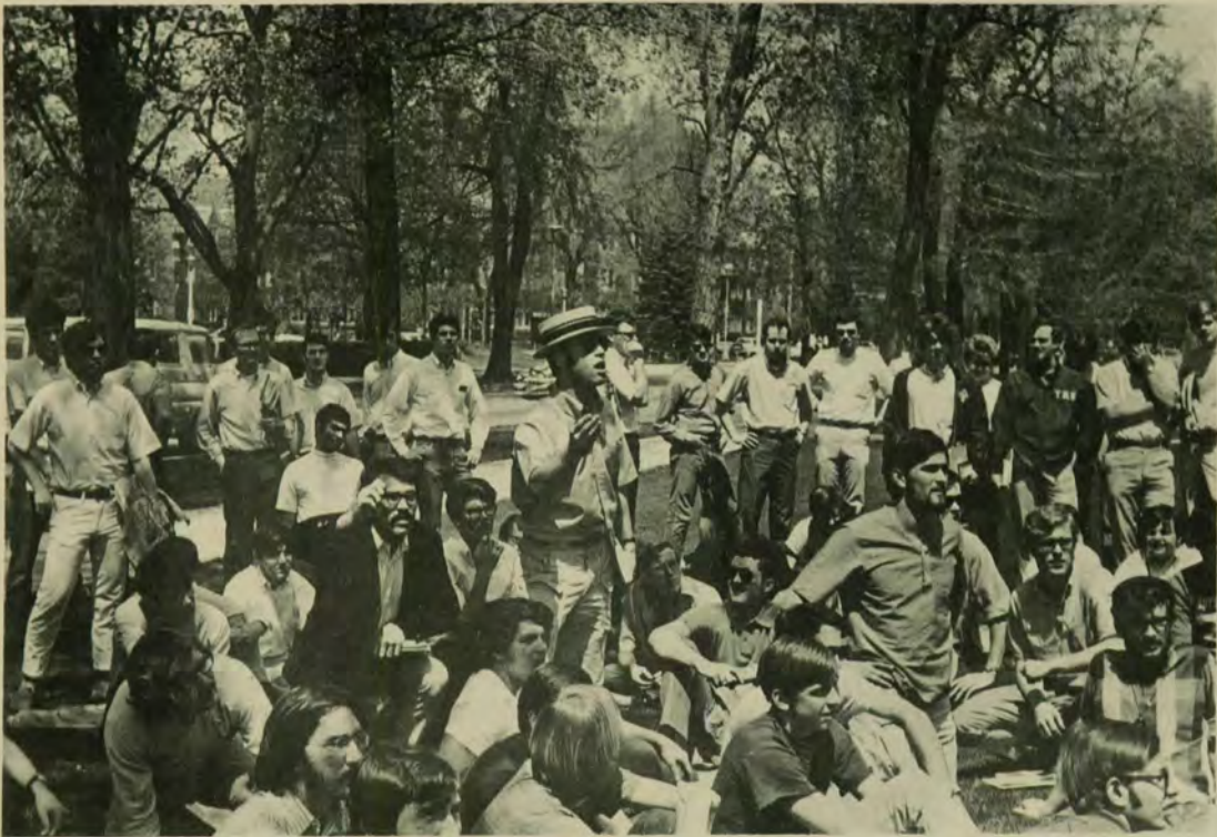
Students gathered outside the Center for Continuing Education in the early afternoon to decide their plans for confronting the Board (above). At right, Father Hesburgh addresses the forum at 5 p.m.