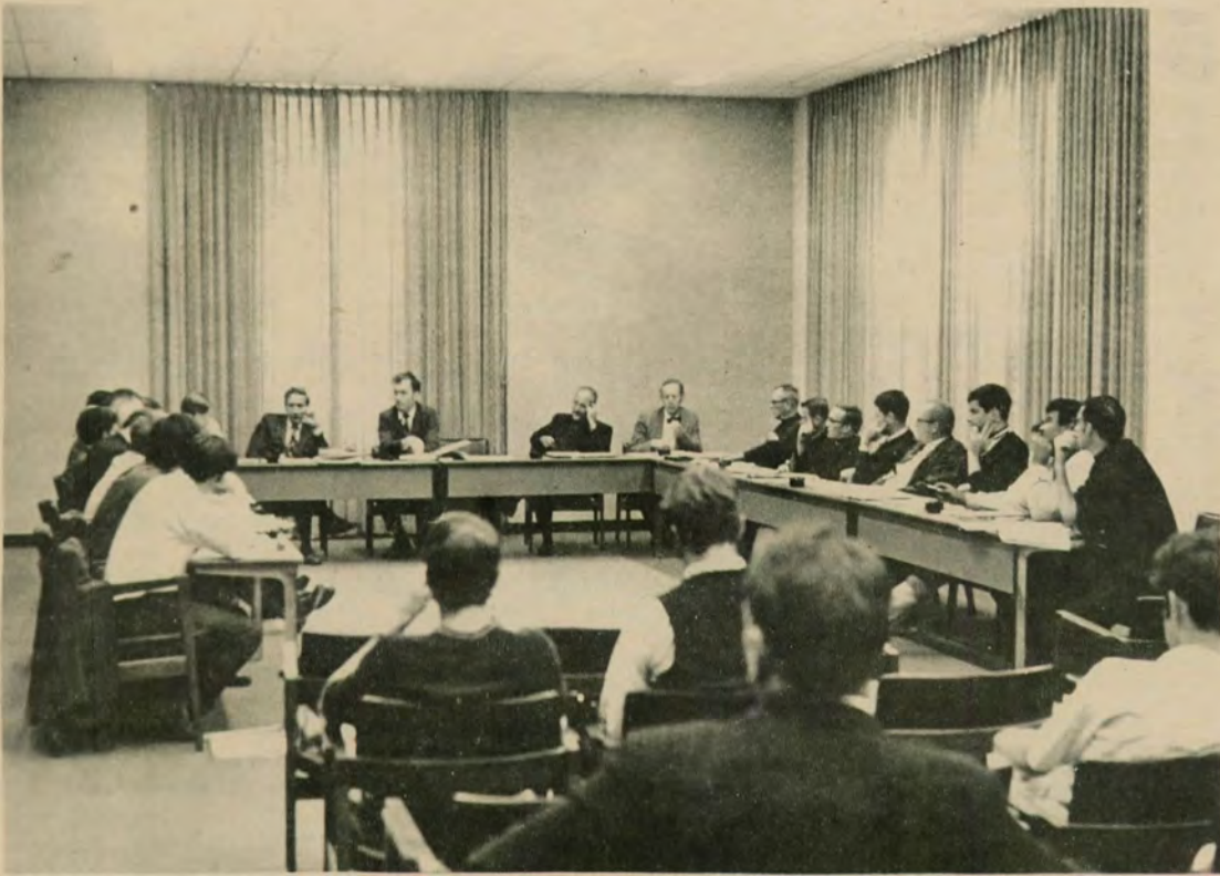
The SLC met in its first session yesterday in the Center for Continuing Education. They discussed the future of the Juggler and elected a new chairman.