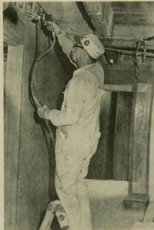
Painter gives Grace corridor the once over as the upper floors slowly near completion.