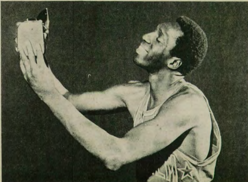
Meadowlark Lemon of the Globetrotters smiles for the camera.

A crowd of 75,000, a world's record for a single game, watched them perform in Berlin's Olympic Stadium in 1951. Their largest U.S. turnout was 36,256, at the Los Angeles Coliseum on April 8, 1953.