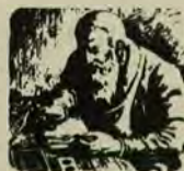
Craftsmen in Optics®

He added that the first objective would be "to restore essential mail services," such as movement of welfare and social security checks, but estimated it would take "several days before meaningful services are restored" in New York.