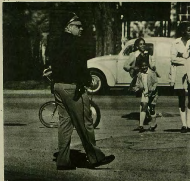
Marchers view of South Bend

When questioned about the reaction Notre Dame students can have to the war, McCarthy said, "It is very possible for us to set up at Notre Dame a sanctuary where we can stand together and co-operate together." Such a sanctuary would provide students with a unified effort to resist induction into the armed services, McCarthy contended.