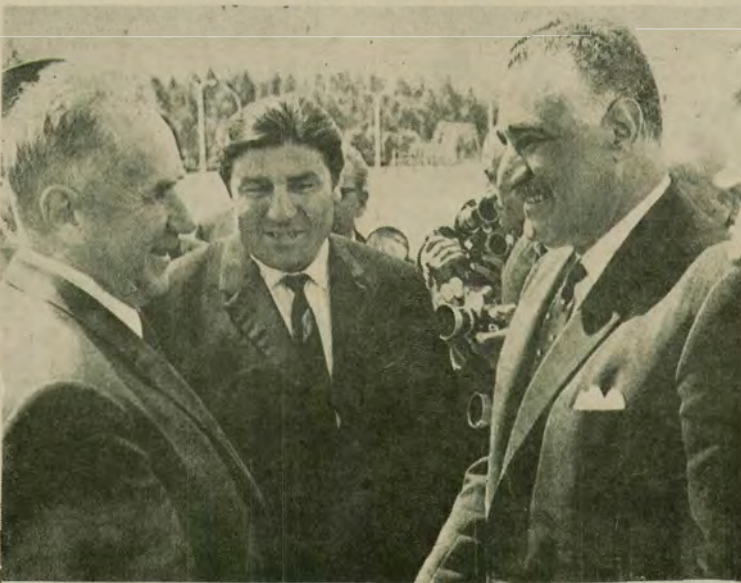
Cairo Radio announced yesterday that Gamel Abdel Nasser, Egyptian President, had died of a heart attack.