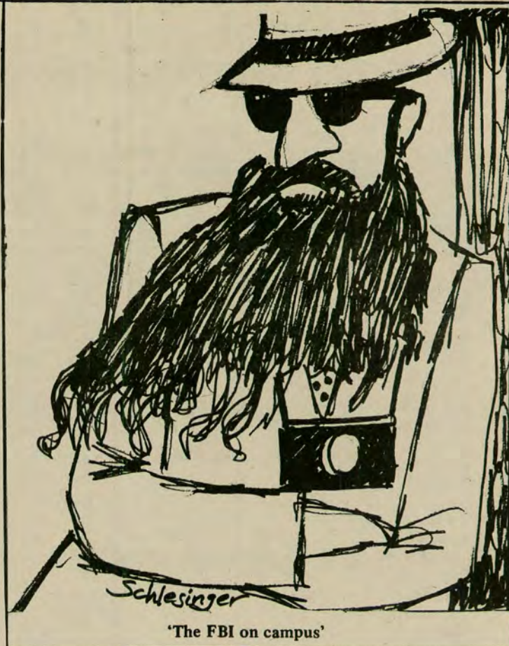
'The FBI on campus'

"He was possibly the most human college president I have ever known, with all the connotations of human weaknesses and human strengths."