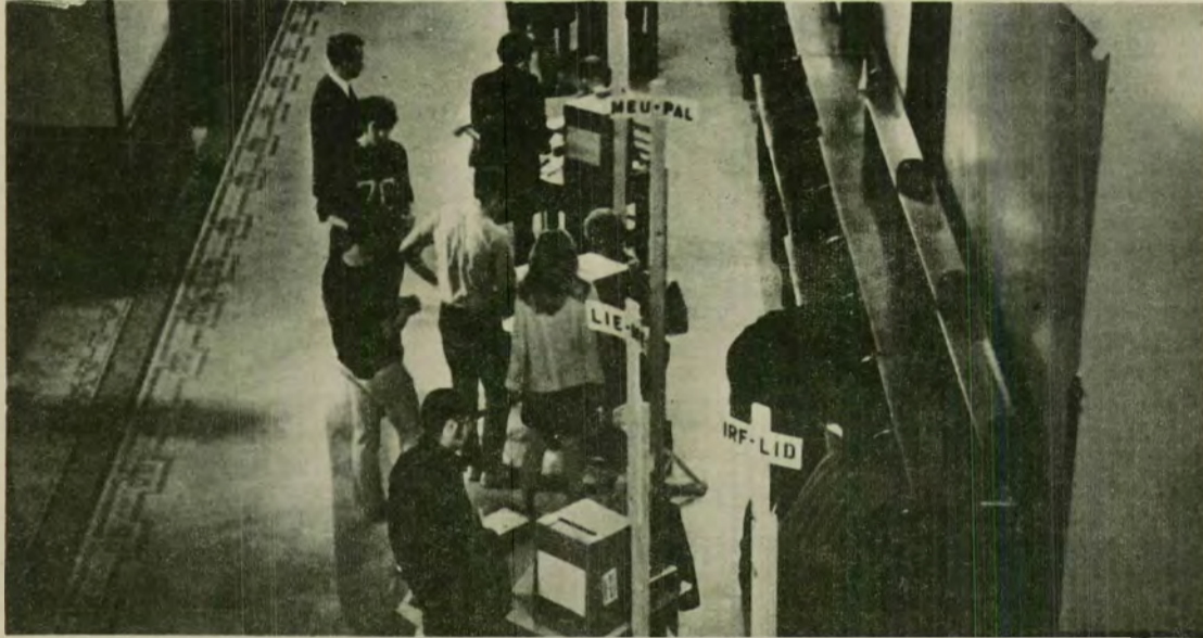
Students cast their referendum votes.

Many students left Friday for the Notre Dame-Michigan State football game on Saturday and consequently did not vote and were unaware of the results until they returned to campus Sunday.