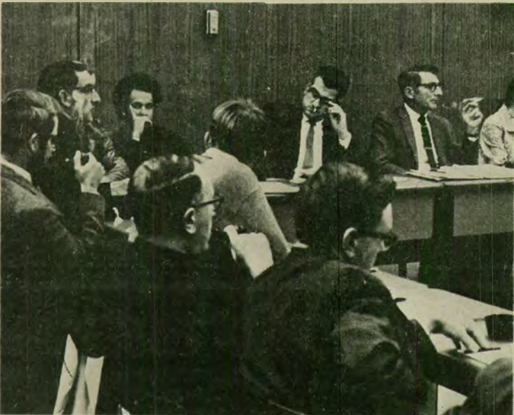
The Student Life Council