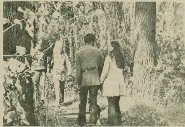
'Lord, I'm a walkin' down the line'