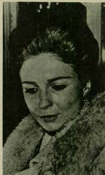
Ti Grace Atkinson

Turning her final attention to the Church as a political power Atkinson revealed in this country "the wealth of the Church is second only to that of the federal government's." She asserted that for this reason, in addition to the Church's blatant interference with the Women's movement, "it must lose its tax exempt status." Atkinson further charged the church with being "a professional conspiracy" and a "pimp for the federal government." She compared the church's conspiracy with that of the Mafia's, declaring that the church was indeed professional.