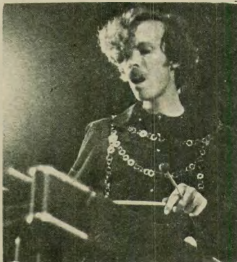
"The hallelujahs for the Gary Burton Quartet at the Berlin Jazz Festival were unlike any ovation I had ever seen for any jazz group."