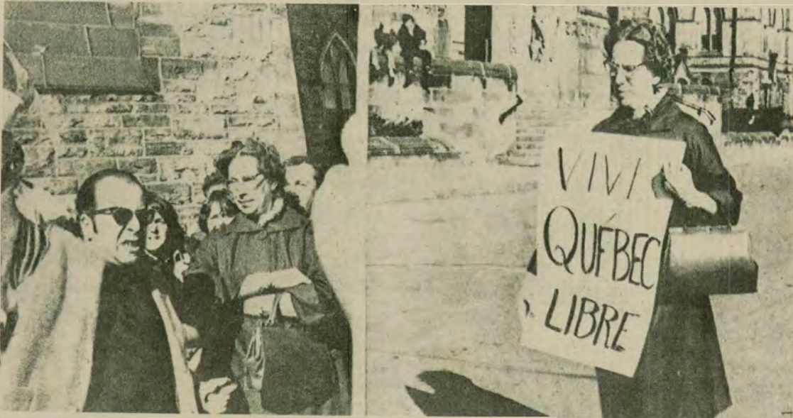
OTTAWA: A lone woman attempted to walk with a "Vive Quebec Libre" sign on Parliament Hill here but a man grabbed the sign from her, threw it on the ground and tore it up. (UPI).