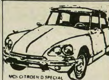
MCN CITROEN D SPECIAL