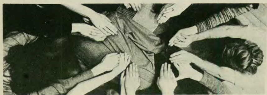
"Hamlet: A Planned Happening" will happen at St. Mary's Little Theatre in Moreau Hall. Performance times are 8:30 pm on 3 and 4 March and 7:30 pm on 5 March.