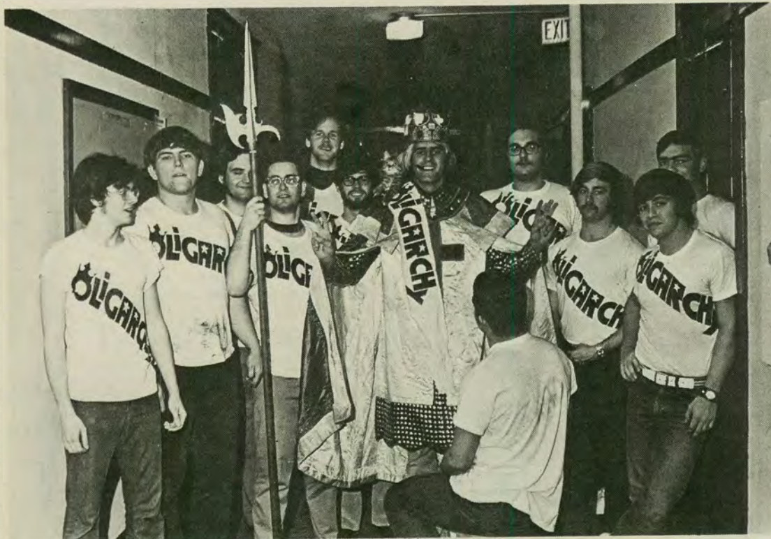
The King and his court in Walsh Hall show their triumph over Student Government poobahs.