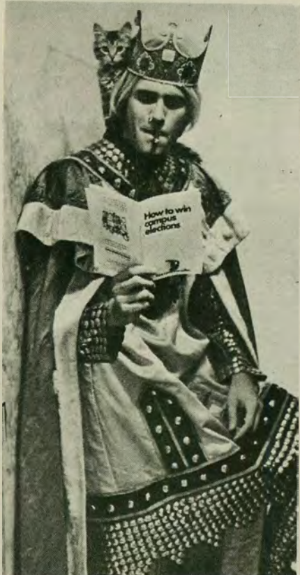
The Prime Mover--apparently reading the right books, begins his reign April 1...