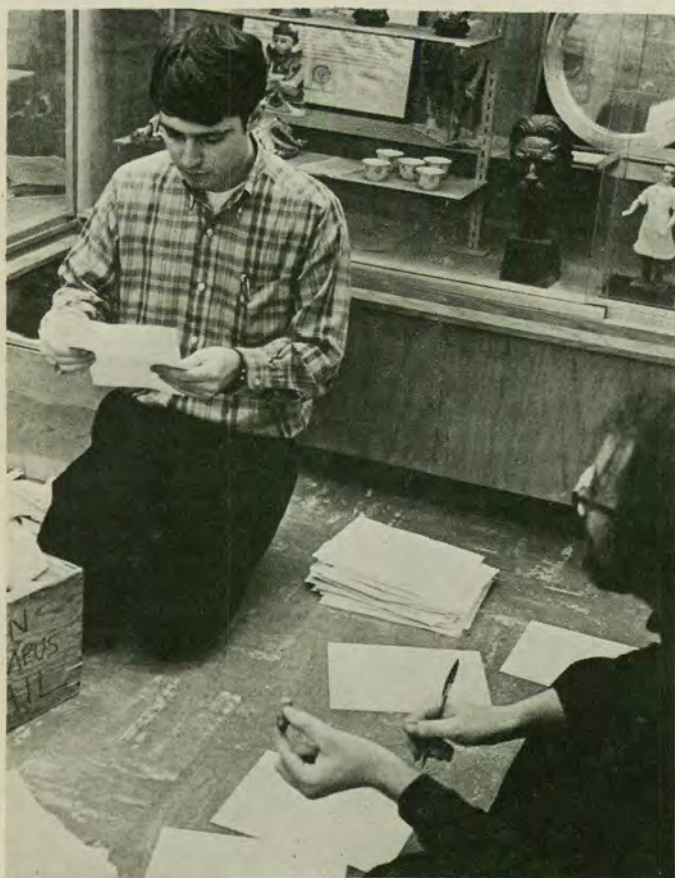
The mew who presented the King with his victory: the Notre Dame election committee count the votes...