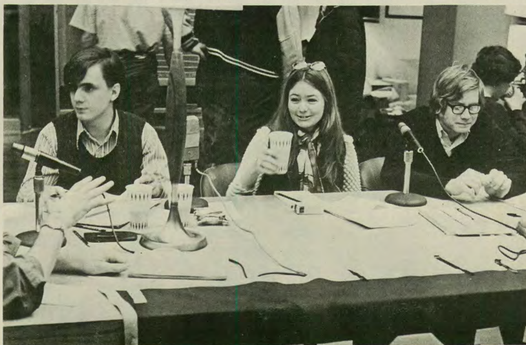
...and the people who announced the Prime Mover's conquest.