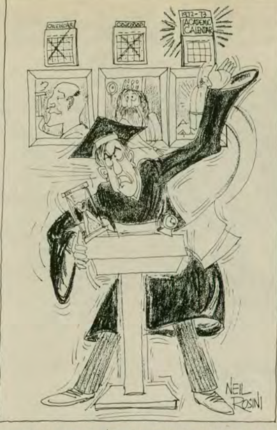
JULIUS CAESAR HAD A ROTTEN CALENDAR AND HE CHANGED IT, POPE GREGORST HAD A ROTTEN CALENDAR, AND HE CHANGED IT, BUT THE QUESTION TODAY, FRIENDS, IS..."