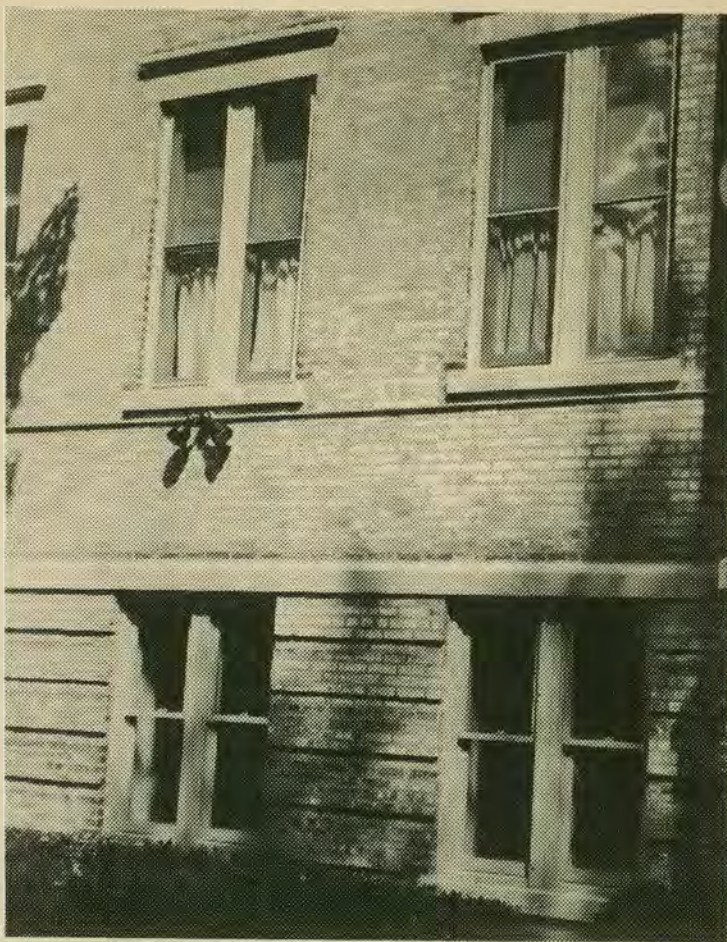
Men continue to work on improving Badin and Walsh Halls. One addition is the new spotlights above.