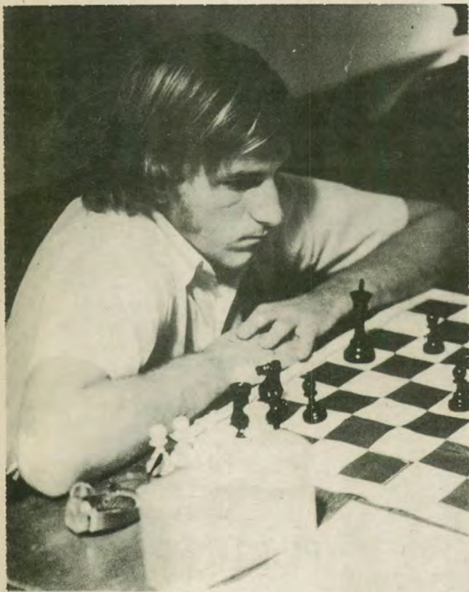
The Observer-Chess Club Tournament continues today in the Rathskellar of Lafortune Student Center. Pairings are on page 6.