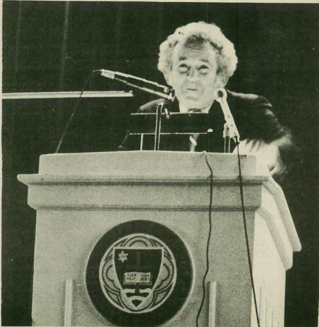
Norman Mailer addresses Stepan Center crowd. He spoke mainly on politics and women's liberation.