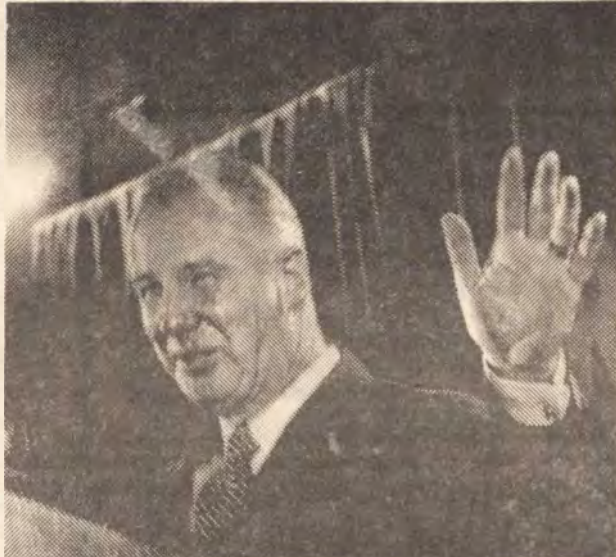
Ex - VP Agnew: sentenced to three year probation and $10,000 fine

Richardson said evidence obtained from several former Agnew associates in Maryland "established a pattern of substantial cash payments" to Agnew while he was governor of Maryland—payments which he said Agnew received as late as December, 1972, while he was vice president.