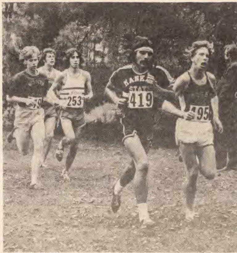
The 18th Annual Notre Dame Invitational Cross-Country Meet will get under way this Friday afternoon on the Burke Memorial Golf Course.