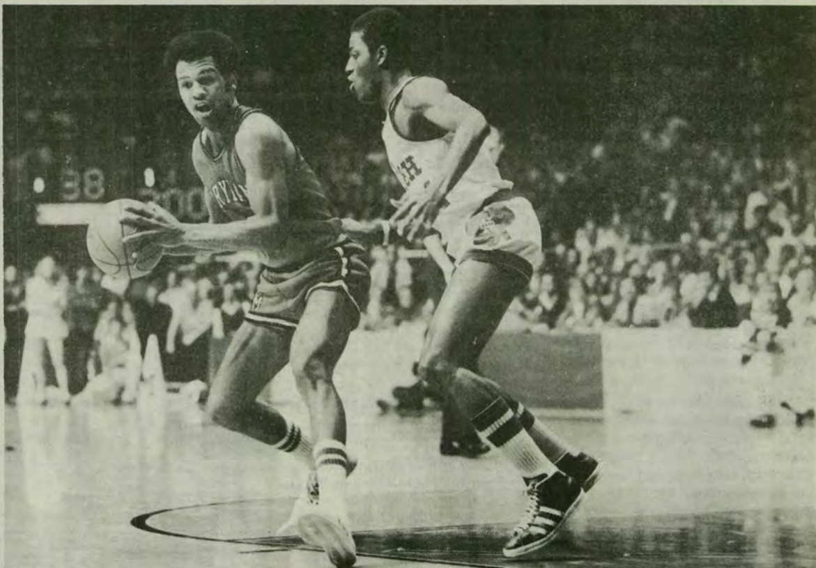
Maryland's John Lucas spurred the Terrapins to a 69-63 victory over the Irish Saturday.