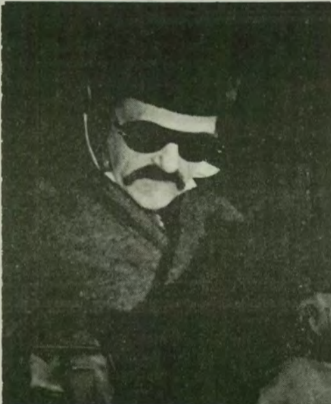
eyes, and Clov would starve if he left. Hamm constantly orders Clov to climb the steps in order to find out what is going on

Contained within the circle of the play itself, various other cycles repeat themselves. Like the last hand of a Whist game after all the important cards have been played, the game plays itself out, necessarily following what has been previously established. The inter-dependent relationship between Clov and Hamm provides never-ending frustration and intentional boredom. Hamm needs Clov to be his