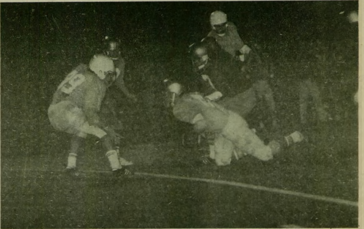
Seven games were played in Interhall football action this Sunday. The rain caused error filled games with shutouts prevailing.

The season will continue this Wednesday with games scheduled at 7, 8 and 9 p.m.