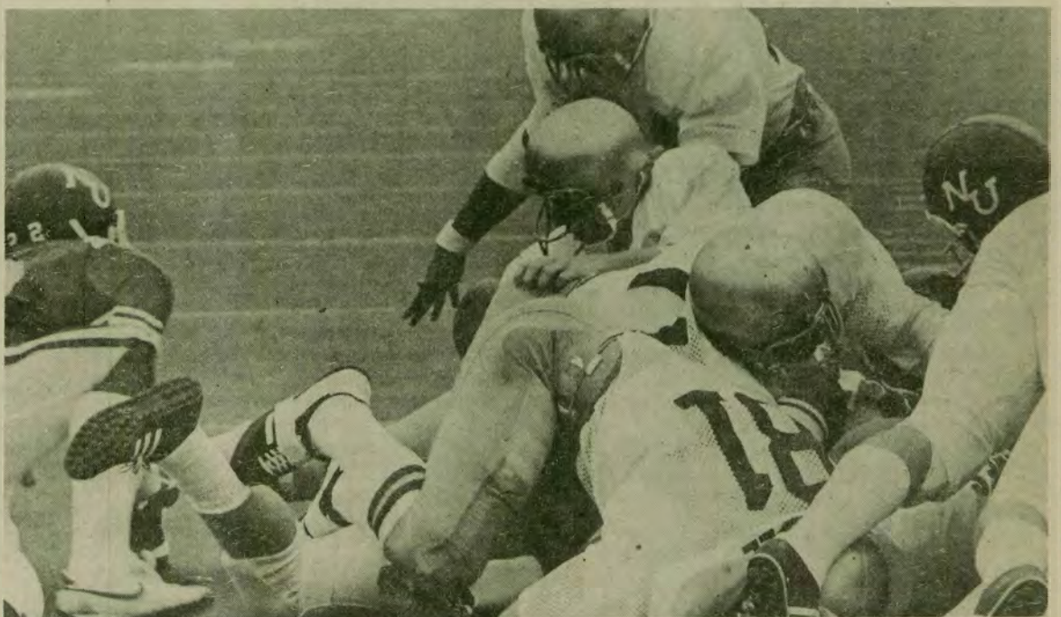
While the ND varsity was piling it on Northwestern, the J.V. team rolled over Indiana by a score of 28-10.

Later in the third quarter, a poor snap from center enabled Indiana to block an Irish punt. The