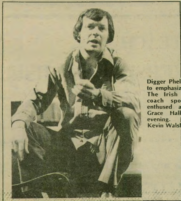
Digger Phelps gestures to emphasize a point. The Irish basketball coach spoke to an enthused audience in Grace Hall yesterday evening.