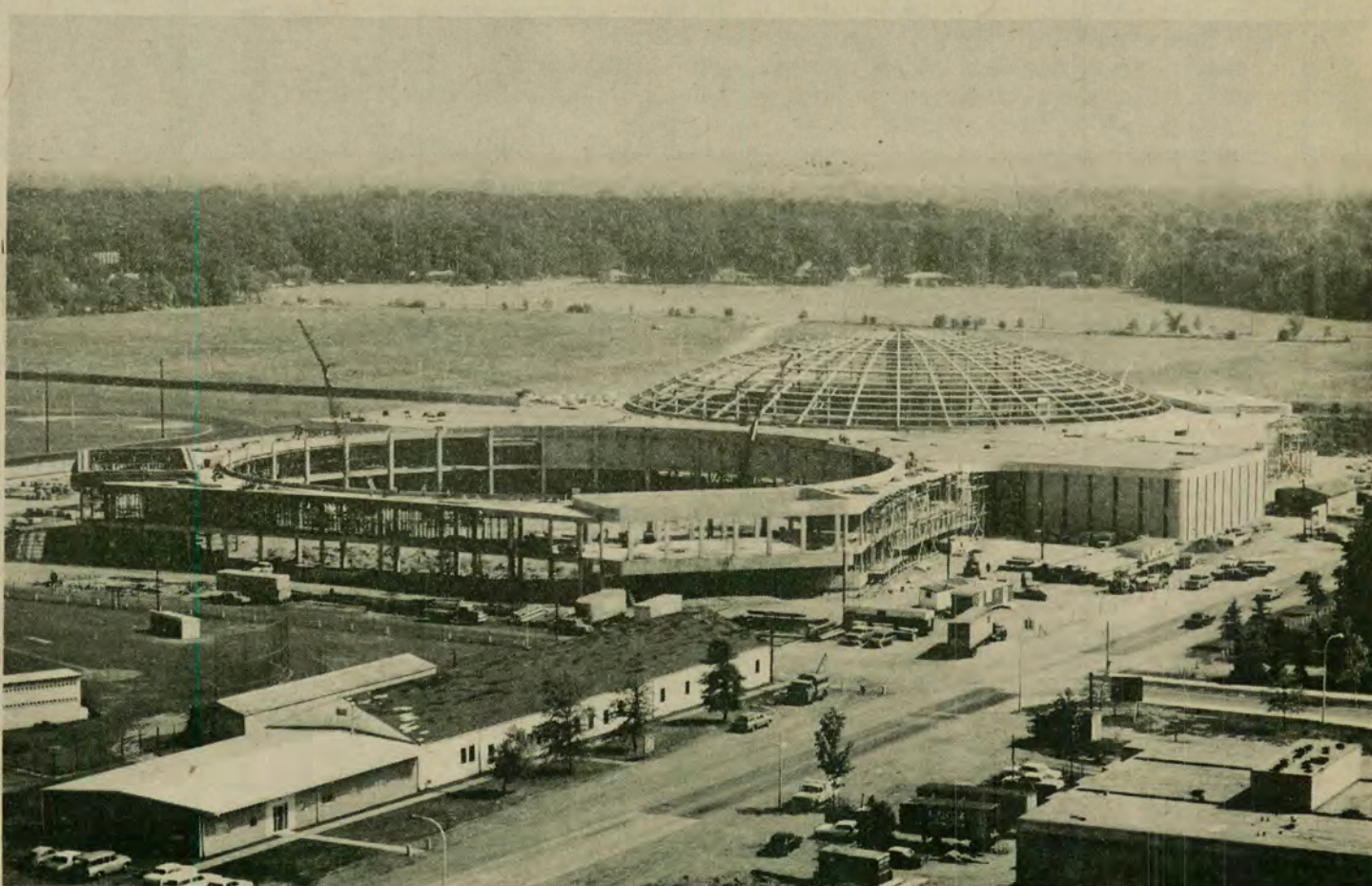
Bombs planted by the DLA devastated the ACC yesterday. A spokesman for the terrorist group said the attack was in retaliation for new fire directives.