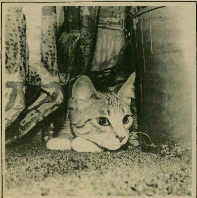
That's right folks, An Tostal is just around the corner!

"We want to understand the University's position more clearly," McKenna commented, "and try to develop a more practical loft policy without sacrificing fire safety on campus."