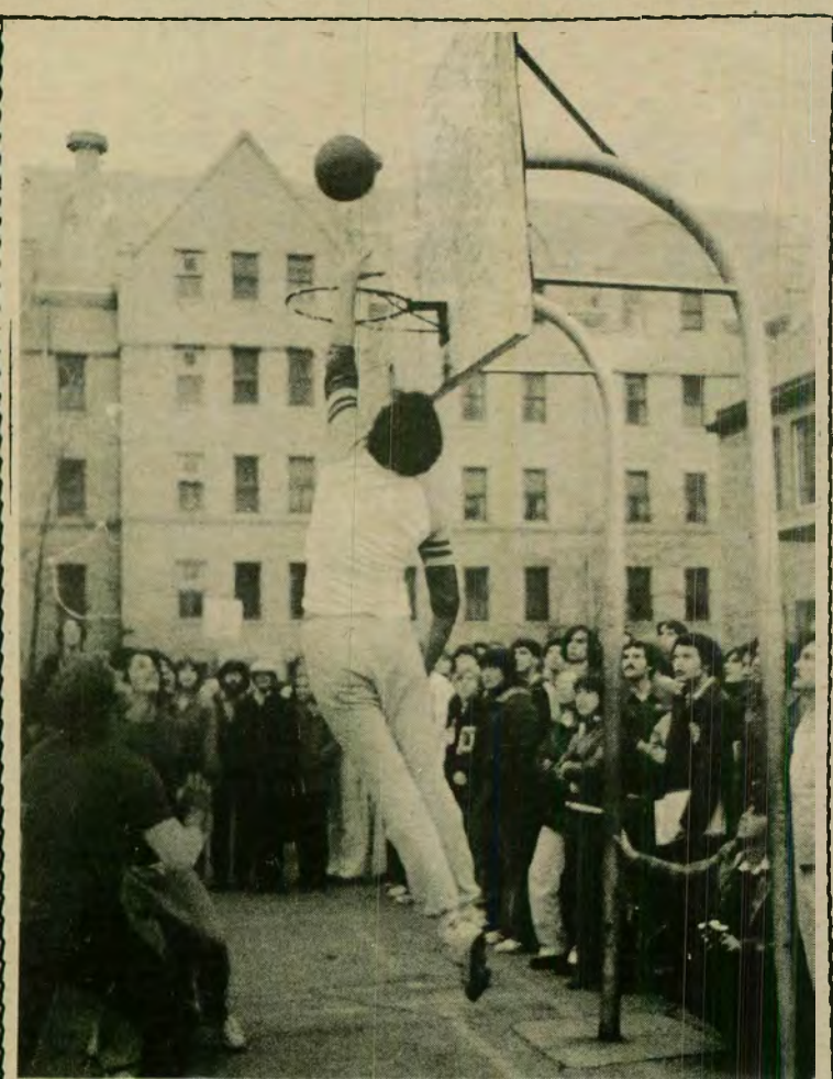
For more bookstore action turn to page 12.