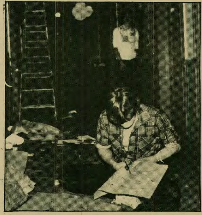
Two ambitious Sorin Hall residents prepare for Screw-Your-Roommate Semi-Formal.

Southland Plaza 2041 E. Ireland at Jonwood (219), 291-1001