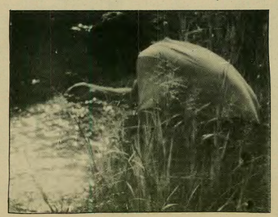
A thirsty hiker takes a drink from a mountain stream.

The staff reserved the weekends for carefree jaunts across the Kenai Peninsula, usually to Homer or Seward. We spent one weekend camping on the Homer Pit, the second largest gravel pit in the world. We pitched our tents on the small rocks close to the water's edge. That night we cooked fresh shrimp on the ends of whittled sticks over the driftwood fire, drank chilled wine and played our guitars. Even at midnight, the sky still glowed under the setting sun and the mountains encircled our campsite.