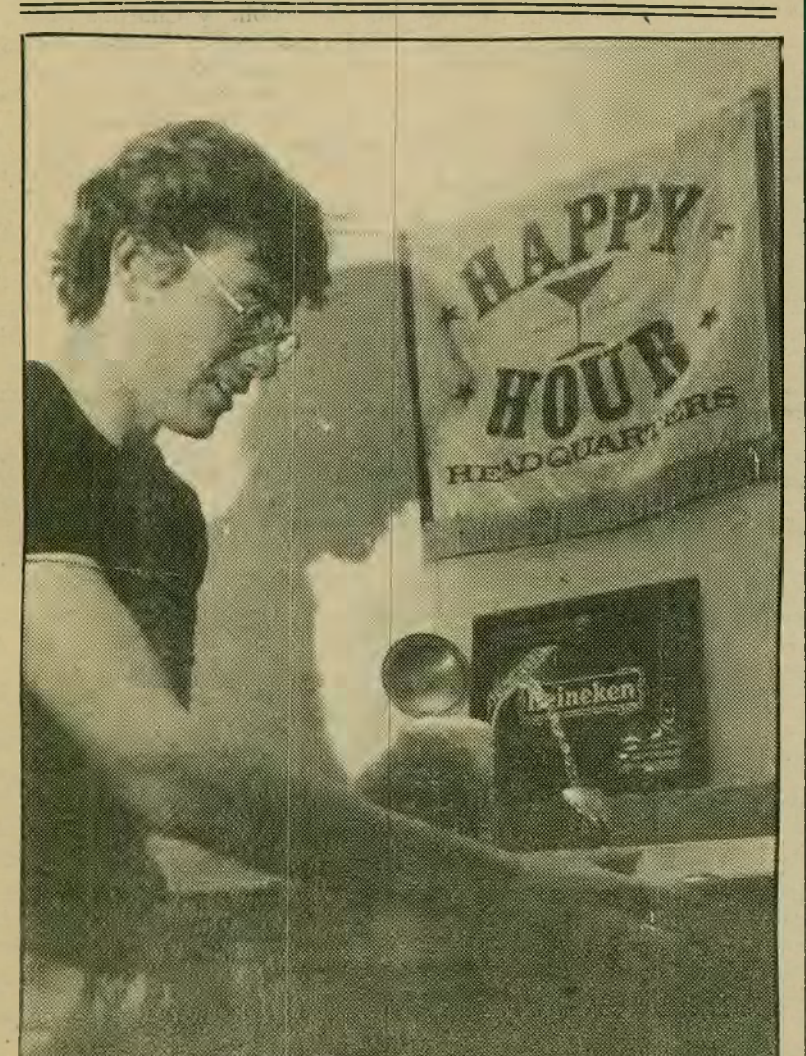
Has this student found the fountain of youth?