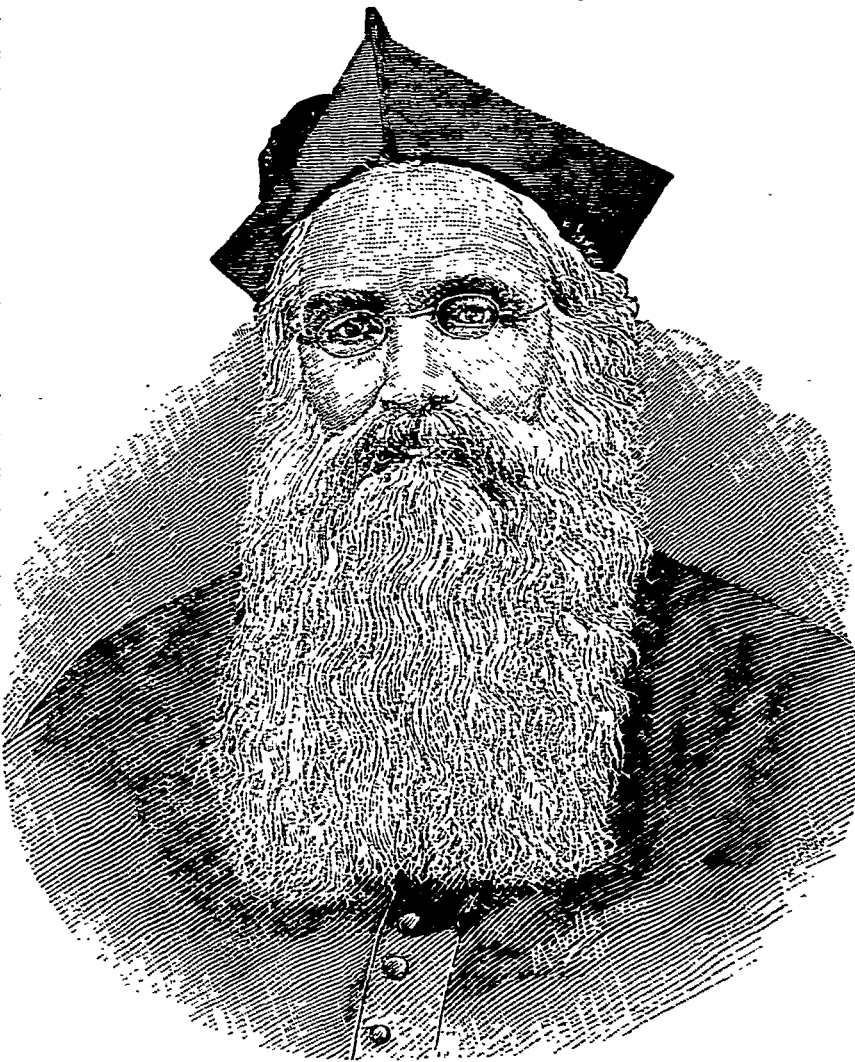
VERY REV. FATHER GENERAL SORIN.