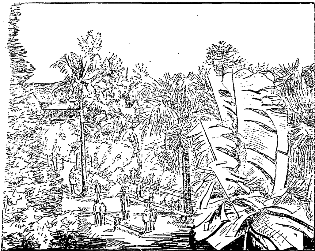
ST. LOUIS' COLLEGE.