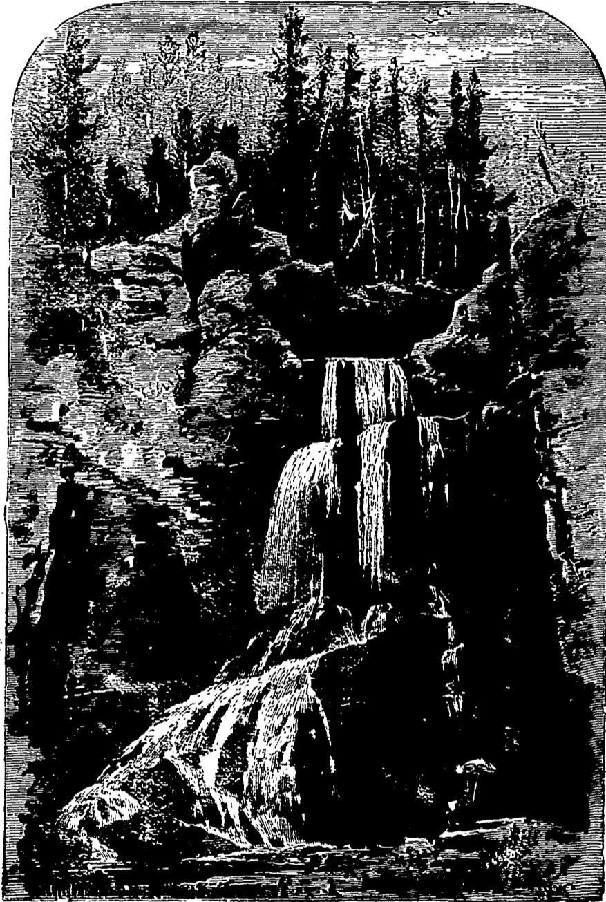
FALLS IN BEAVER CANYON.

Trout fishing is excellent, and the art is plied at all seasons both for pleasure and for remuneration. The fish weigh from half a pound to