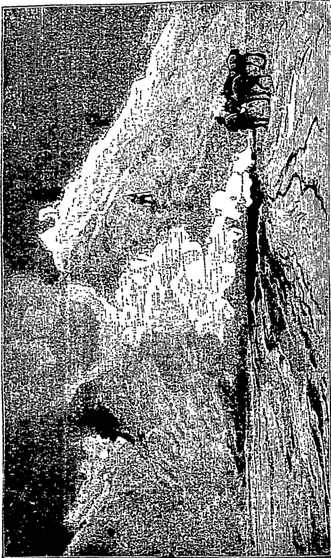
"SULPHUR MOUNTAIN" AND PLUNGING POOL.

It is composed of stalagmite of a grayish white appearance glazed over with a silicious bead-like deposit which sparkles intensely in the strong sun light. We climbed to the top of this old "roarer" and looked down its throat. The water was in violent ebullition, rumbling, tossing and splashing restlessly. The walls of the throat are scintillating, very even and hard, but coarse as sand-stone. Dull, explosive sounds are frequently heard, and the water is at times thrown several feet above the orifice. Once as our clerical friend was peering boldly and irreverently down the mouth of this venerable old fountain, the water shot up so suddenly as to throw him