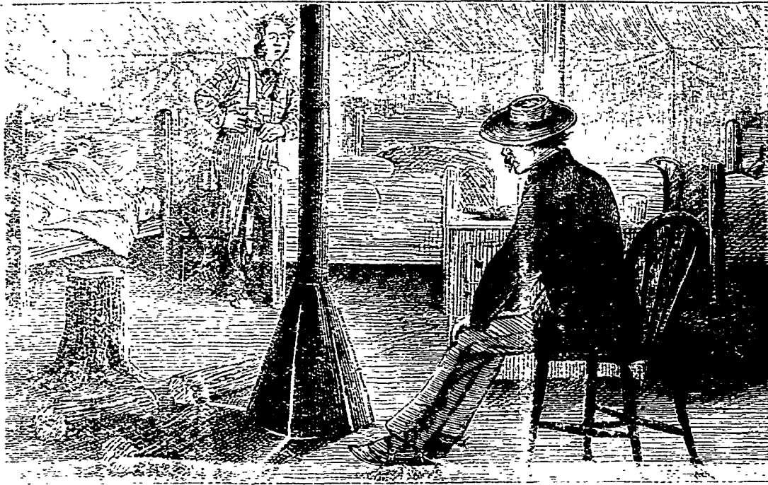
CANVASS BEDROOM, FALLS HOTEL.

supreme. Soon this unearthly pageantry will vanish too, will crumble away and go down with the flood, for mountains too have their grave—they and the universe. What a huge contest this; what an awful struggle of these infinities that measures itself by centuries! Men come and go and vanish from the earth; forests rise and live their period and disappear; these, struggling on for unnumbered ages, stand the brunt of storms and contending elements, but succumb no less surely. How valiantly stand these gigantic champions, and yet how mourn-