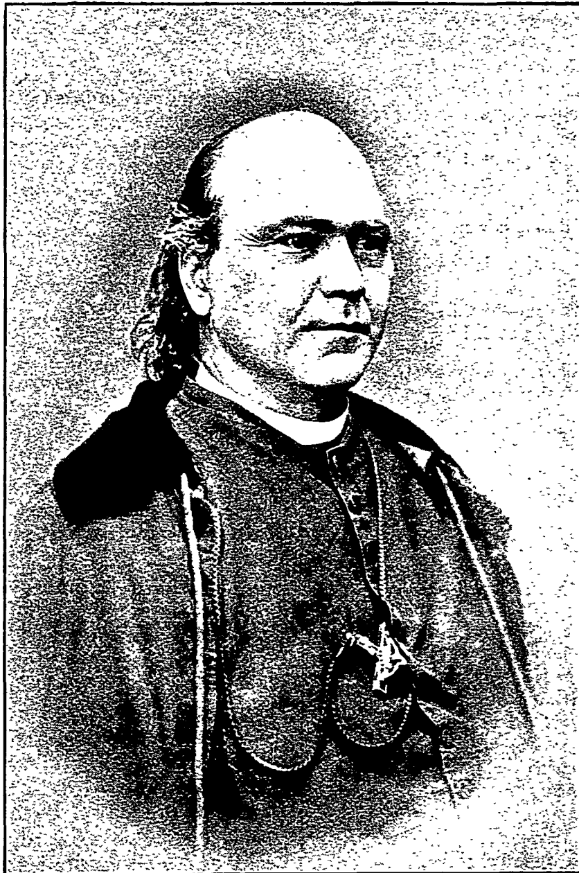
VERY REV. WILLIAM CORBY,

attending the mission of South Bend, at that time too small to have a resident pastor. Father Corby entered upon the discharge of his twofold duty with the same earnestness that he would have exhibited had he known that this would be his occupation for life. But he was called to a different field of usefulness. Chaplains were wanted for the army, and Father Corby, filled with the spirit of patriotism as well as zeal for the spiritual welfare of his fellowman, offered himself as a volunteer for that post. In December '61 he received from the Governor of New York a commission as Chaplain in one of the New York regiments, with the rank of a cavalry officer. His regiment formed part of the "Army of the