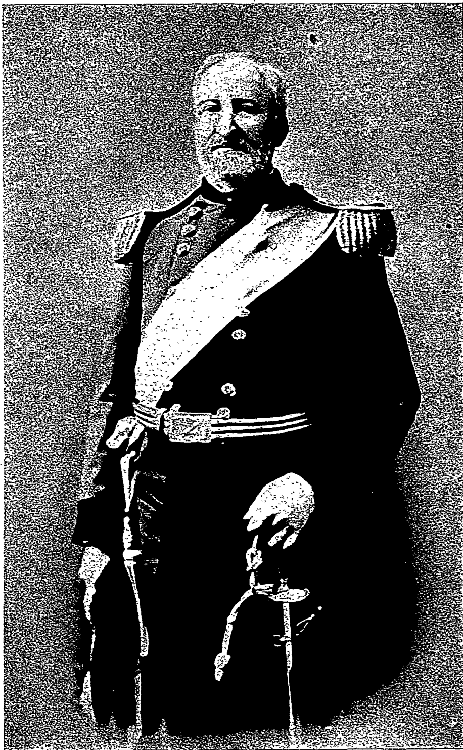
MAJOR-GENERAL WILLIAM STARK ROSECRANS.

The medal itself is simple and beautiful. From a broad golden bar which bears the words "Lætare Medal" in purple enamel depends a massive disk of finest gold with raised edges and sunken centre. It is a bit of art work which any goldsmith might be proud to claim as his creation. Though in general the design never changes, each medal is unique, because the artist, each year, strives to epitomize