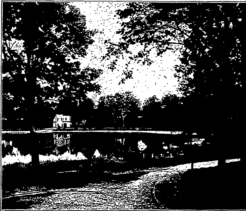
SAINT JOSEPH'S LAKE.

Past the Infirmary, with its old-fashioned garden, screened from the careless gaze by an unkempt, wayward hedge of lilacs and full of the spring flowers that were dear to our grandmothers—phlox and Sweet William, jonquil spears and crocus shields, the long ovals of the lily-of-the-valley leaves, transplanted wood-violets half-hidden in the shadow of the flaming tulip cups, and the quaint Dutchmen's breeches which sentimental young persons call by a tenderer name—down an avenue of apple-trees already stripped of their evanescent spring-time glory, leads a way that is known to the Boat Club and to all who are wise in the lore of Notre Dame. A fortnight ago you would have walked on a carpet of fallen pink petals, and you would have acknowledged the aptness of a Minim's simile—"Them apple-trees are like great big popcorn balls, circus popcorn, that nobody has money enough to buy," but now the fragrance of the