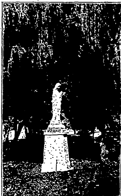
UNDER THE WILLOWS.