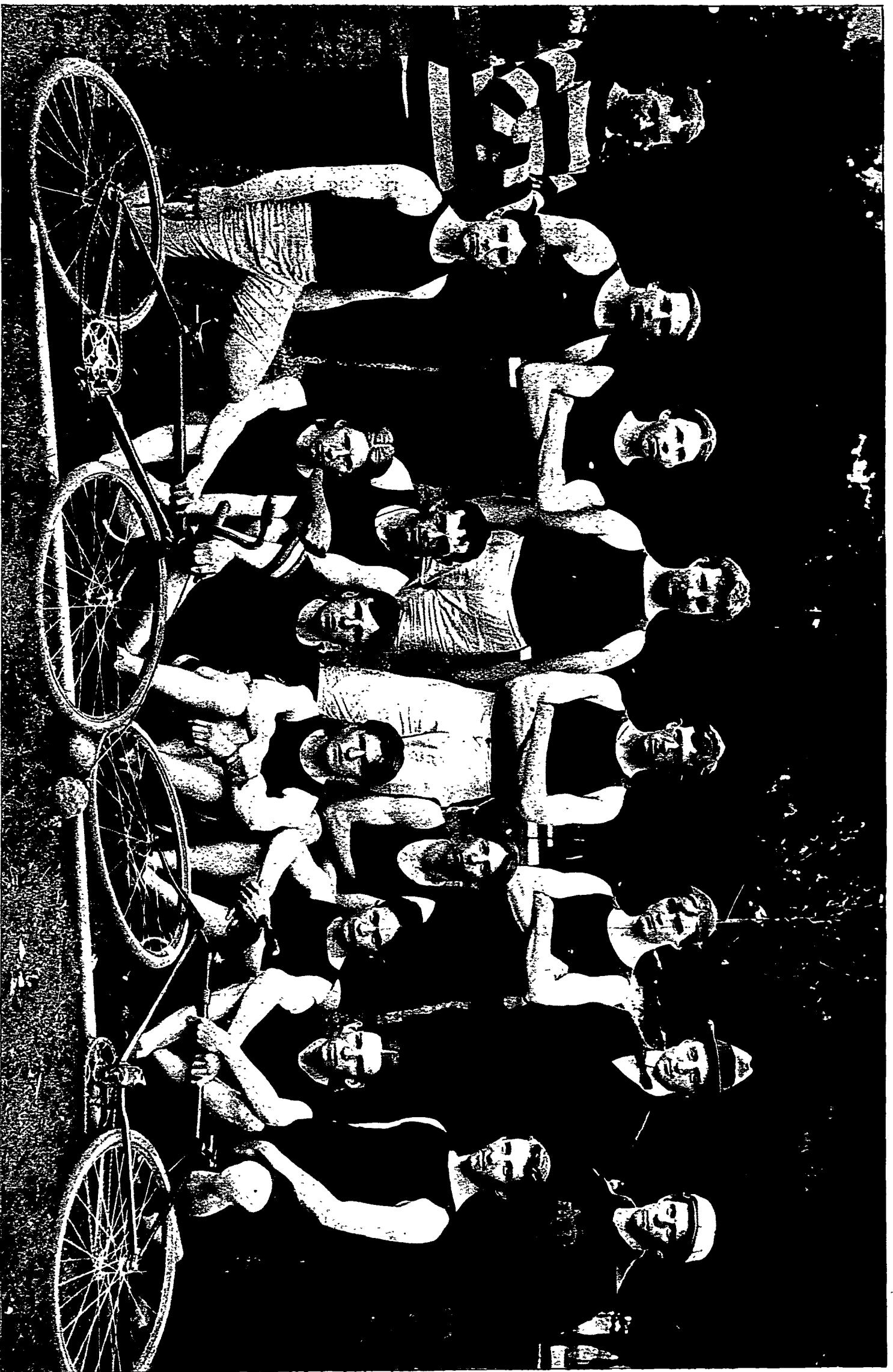
N. D. G. CYCLING TEAM, 1898.