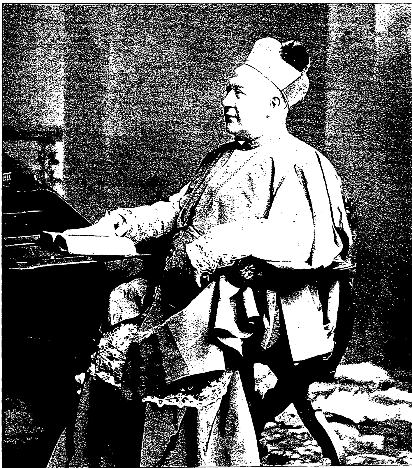
THE MOST REVEREND THOMAS JOSEPH CARR, D. D., ARCHBISHOP OF MELBOURNE, AUSTRALIA.