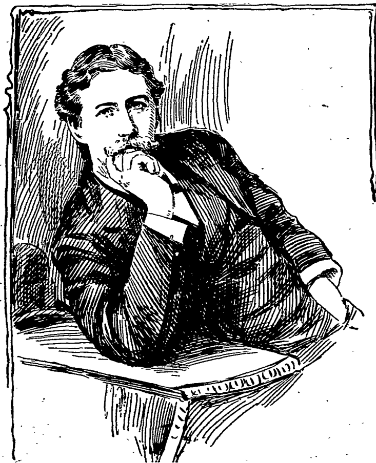
AUGUSTIN DALY, LL. D., '89; LÆTARE MEDALLIST, '94.

To the great mass of his fellow-countrymen, who care nothing for a play manager more or less, the death of Augustin Daly is not noteworthy; but to the large class who take an interest in matters theatrical, to those who study the stage and watch its evolutions, to