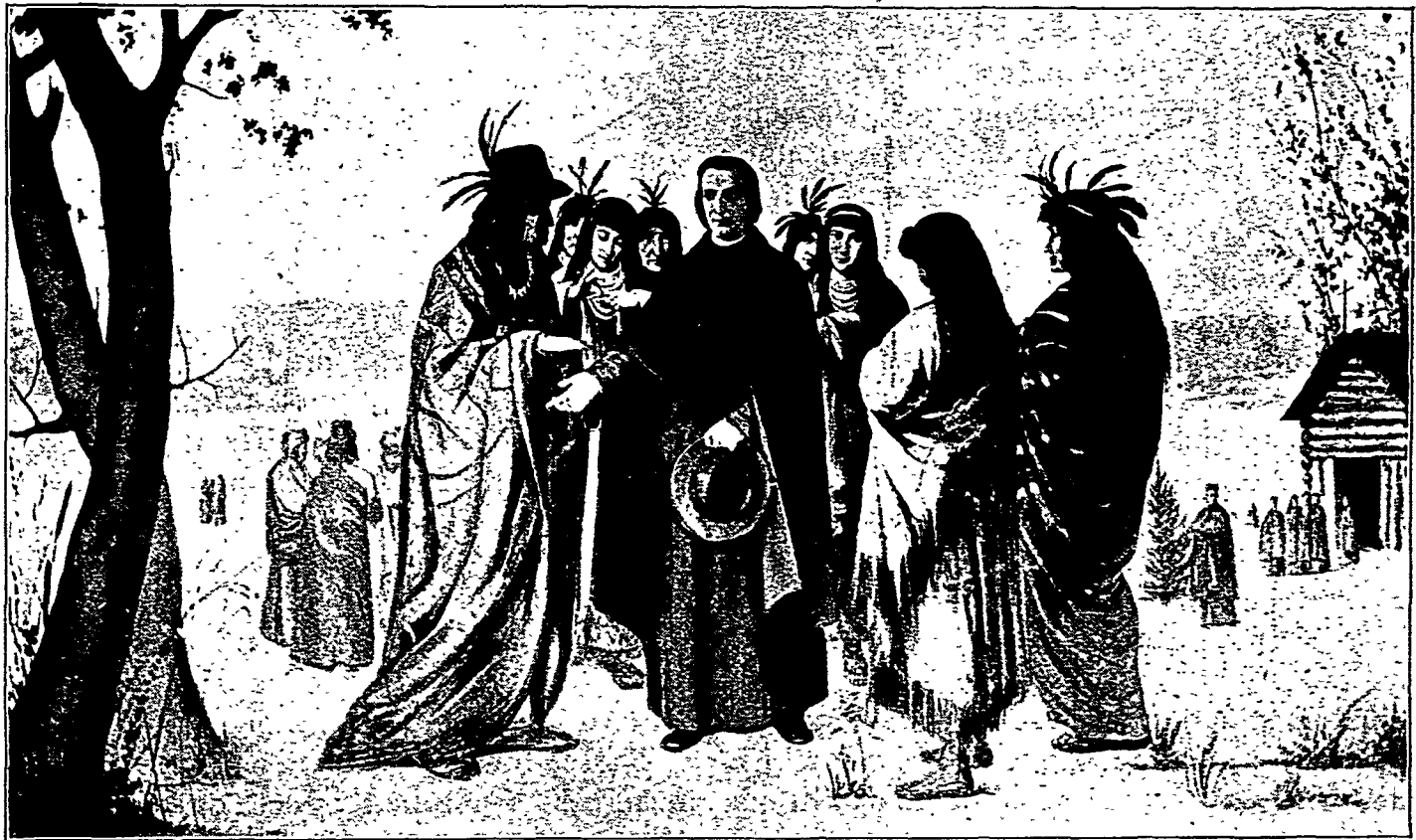
FOUNDING OF NOTRE DAME.