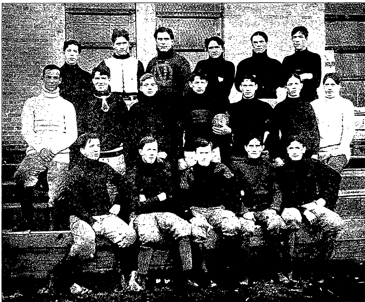
INTER-HALL TEAM OF 1902.